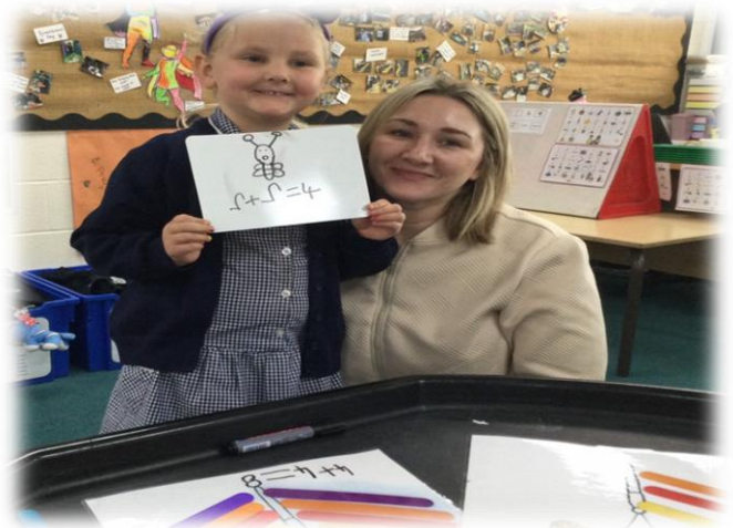
Reception Stay & Play