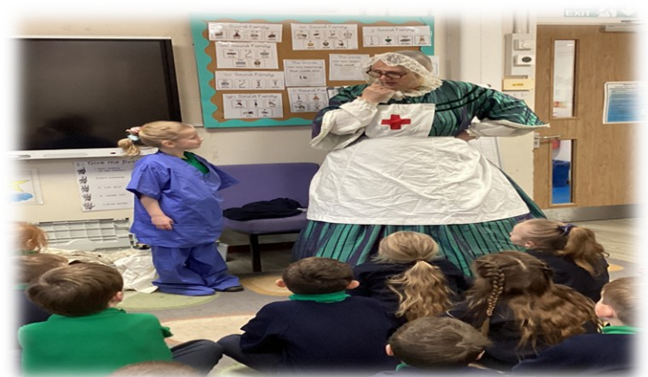
Year 2 Florence Nightingale Workshop