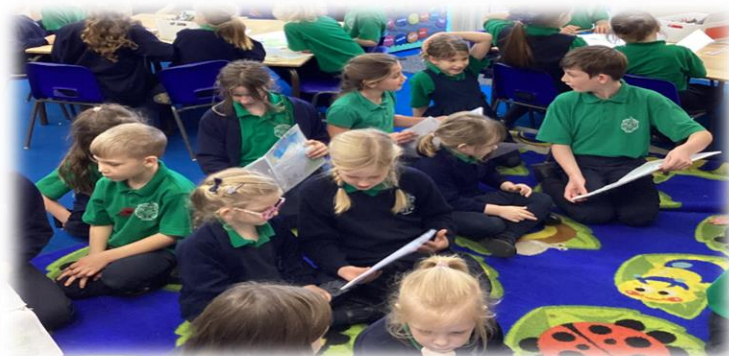
Year 5 visited Year 1 to share their pop-up books made in their DT lessons.