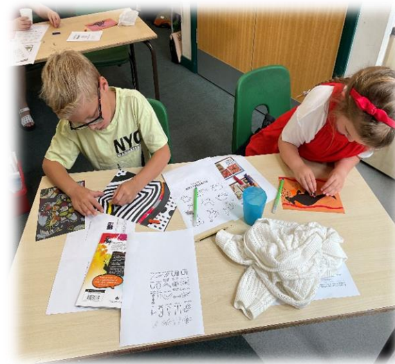
Aboriginal Art – Australia