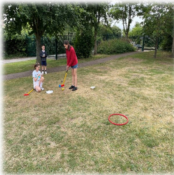
Tri-golf in USA