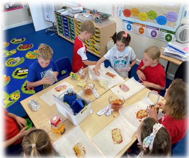
Pizza making – Italy