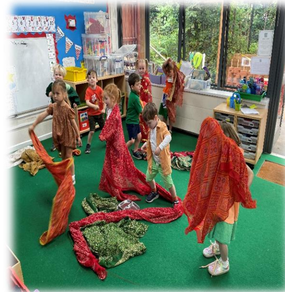
Nursery – India