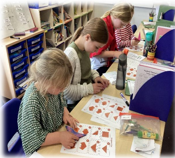
Origami - Japan