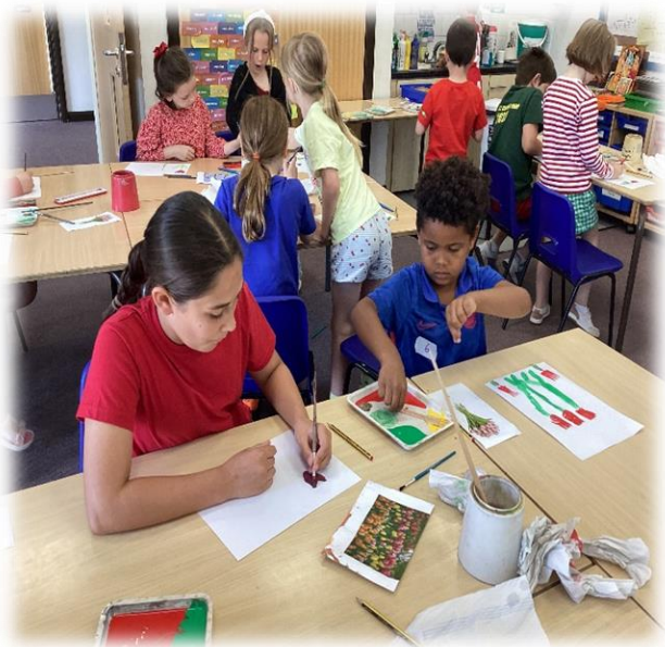
Tulip painting in Holland