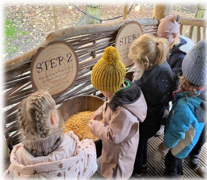
Oak class making their reindeer food!