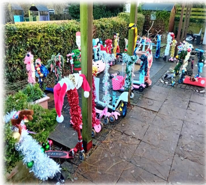
The 53 entries for 'Bling your scooter to school day!'

A huge thank you to everyone who attended either performance. The money from our ticket sales is being donated to our chosen charity – Garden House Hospice.