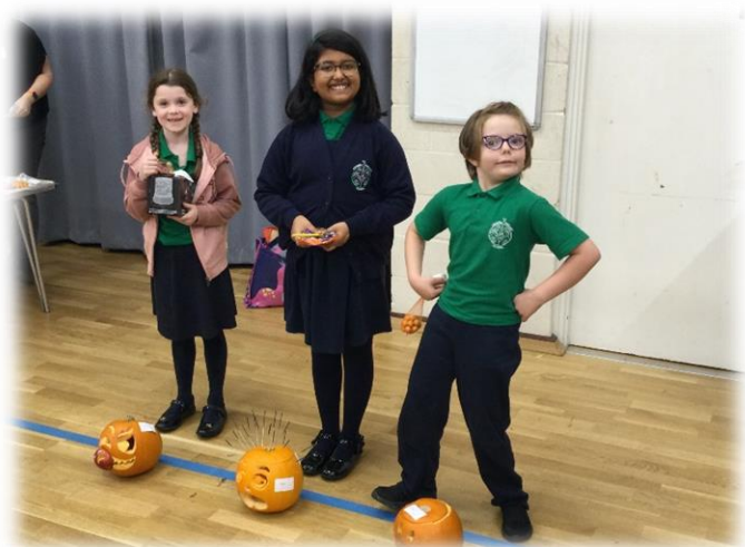
Year 3 Winners