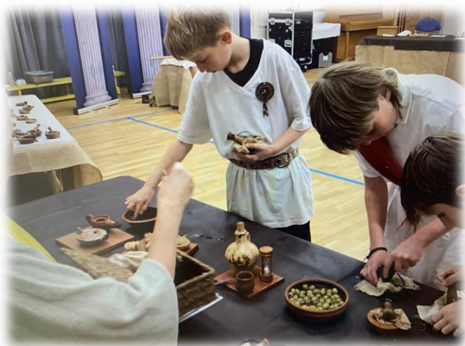
Year 6 food tasting during their Ancient Greek day.