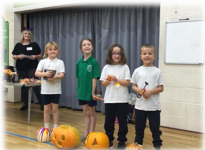
Year 2 Winners