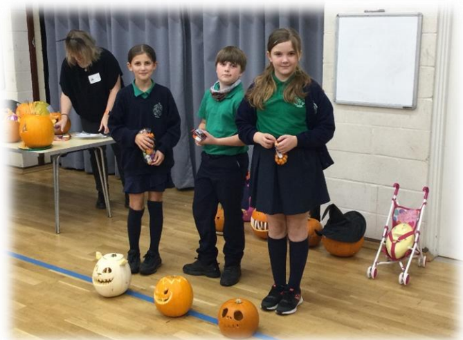
Year 6 Winners