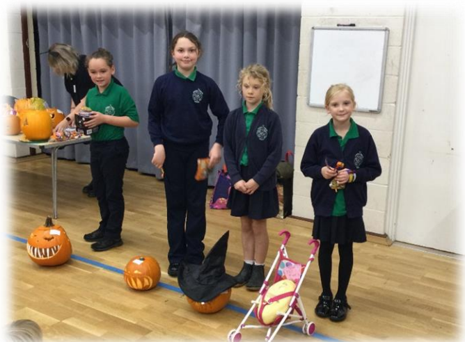
Year 4 Winners