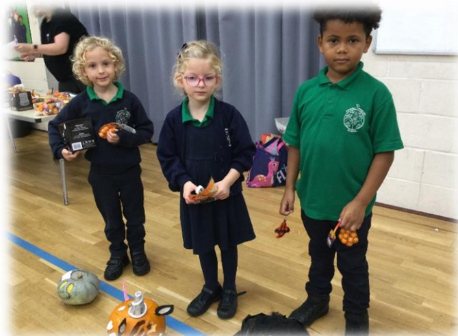
Year 1 Winners